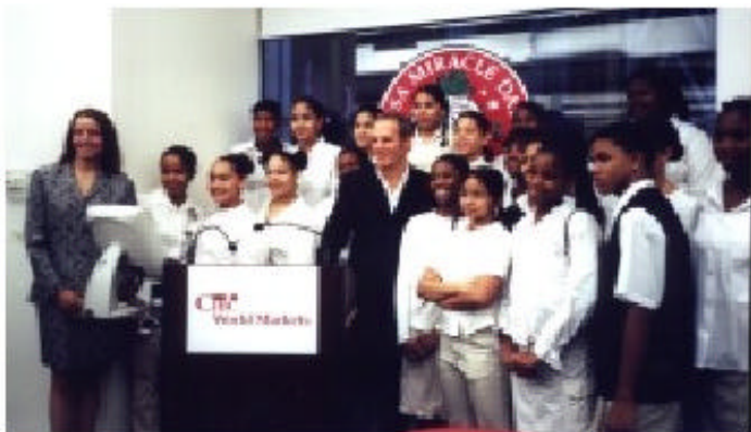
The Tito Puente School choir joins Michael Bolton in singing "God Bless America" at CIBC