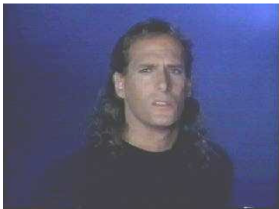
Still from "Back on My Feet Again" video.